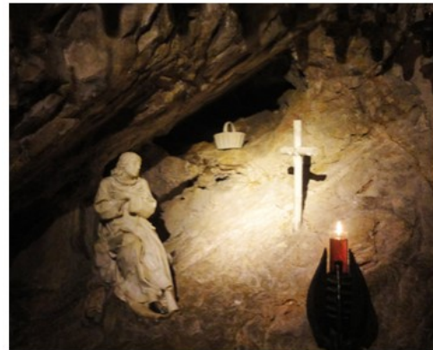
Sacro Speco, Subiaco — The cave in which Saint Benedict lived