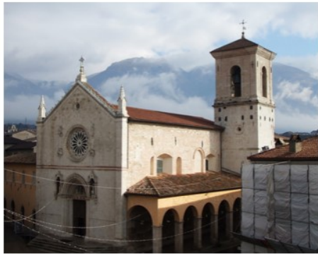
San Benedetto Church, Norcia — The Birthplace of Saint Benedict

After founding twelve communities of monks at Subiaco, Italy, Benedict of Norcia (480 AD - 21 March 547) traveled to Monte Cassino where he established a monastery and wrote "The Rule." This simple set of guidelines for how the life of a monk should be lived has become one of the most influential works in all of Western Christendom.