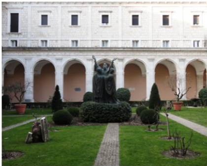
Cloister Garden, Montecassino — The place where Saint Benedict wrote The Rule and died