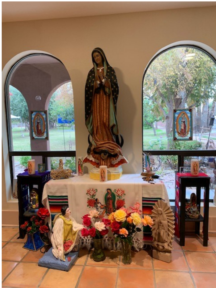
Sanctuary Altar for Feast of Our Lady of Guadalupe and our 21st Anniversary of Monastery