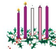
Second Sunday Of Advent

Second Sunday of Advent: the "Candle of Peace," or "Preparation," or in still other traditions the "Candle of Love" candle is lit, scripture is read, a devotional may be given, and prayer is offered.